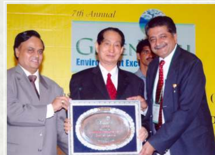
Shri S.C. Jamir, Hon'ble Governor of Goa honouring Shri H.K. Sharma, CMD with Greentech Silver Award for up grading ecological balance in the Projects of the company. The upcoming Rampur Hydro Electric Project also received the Greentech Bronze Award for Instituting organized dumping activities. The project is likely to generate 30,000 lac cum. of muck during construction (31st August 2006)