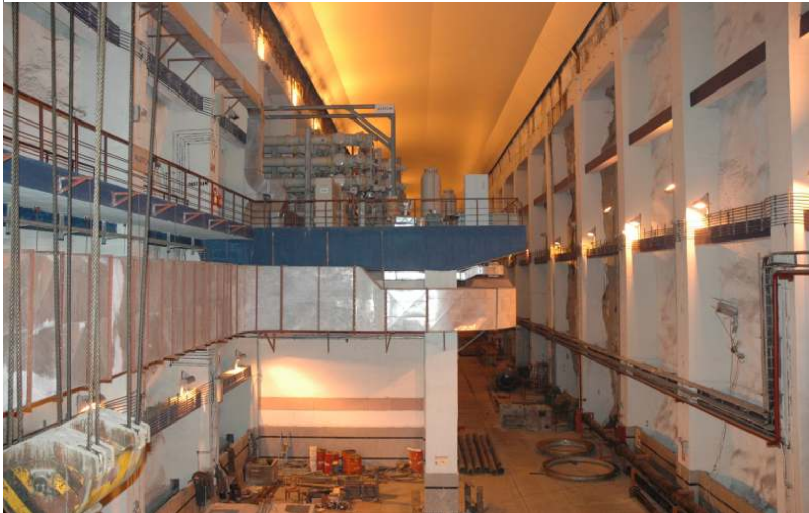
A view of Transformer Hall and GIS installations