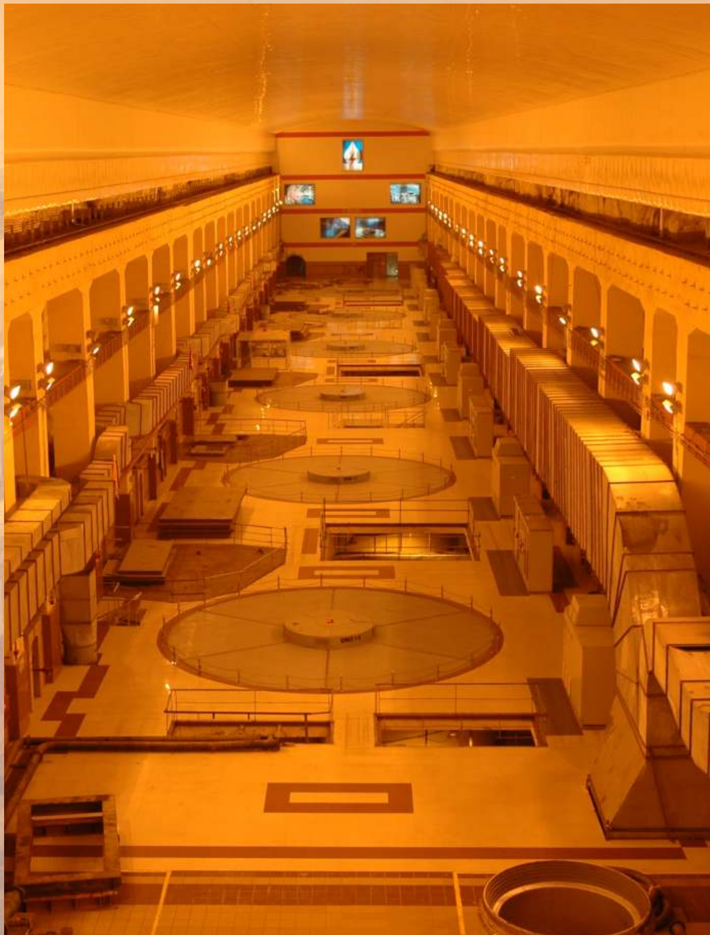
Power House of 1500 MW Nathpa Jhakri Hydro Power Station