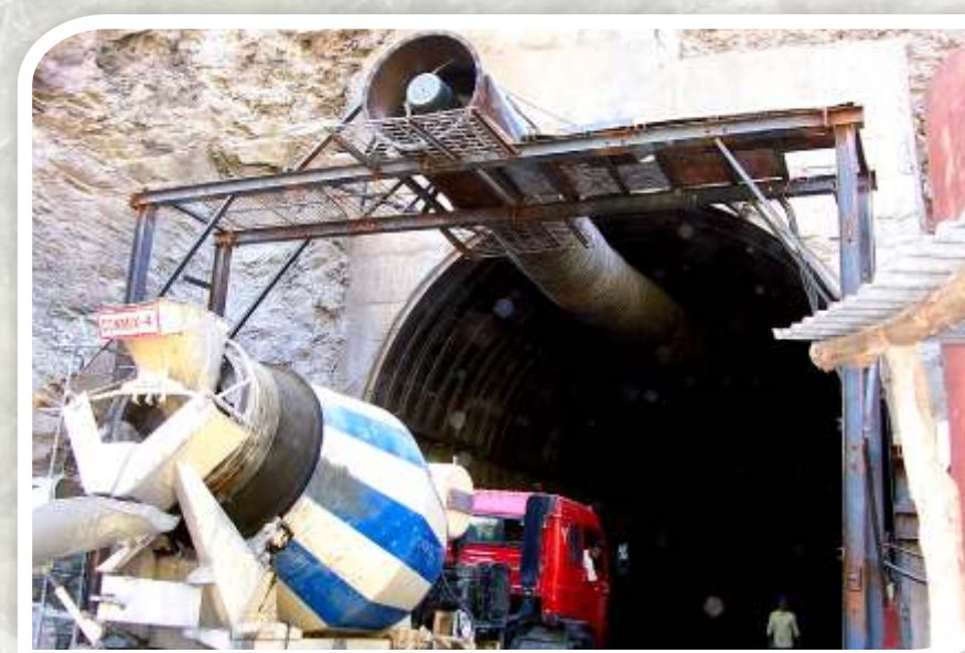
Goshai Adit of 412 MW Rampur Hydro Electric Project under construction

As regards Rehabilitation and Resettlement of displaced and project affected families, your Nigam has so far provided 61 families with employment, 46 families with agricultural land, 20 families with built up houses, 44 families with cash assistance for construction of houses, 3 families with shops in shopping complex, Jhakri. There are 61 more families to whom employment could not be provided. As such, alternative benefits i.e. self-employment opportunities have been put in. There are three schemes, namely, Shop Scheme with seed capital of Rs.50,000 to start business, or taxi scheme with financial grant of Rs.50,000 and hiring the taxi for four years on hire charges and other terms or payment for starting some self employment venture of Rs.3.00/Rs.2.00 lakhs depending upon the land acquired. Camps are organised to facilitate the affected families to choose one of the schemes as may be found suitable. 27 families have opted for scheme of starting self-employment venture in lieu of employment so far.