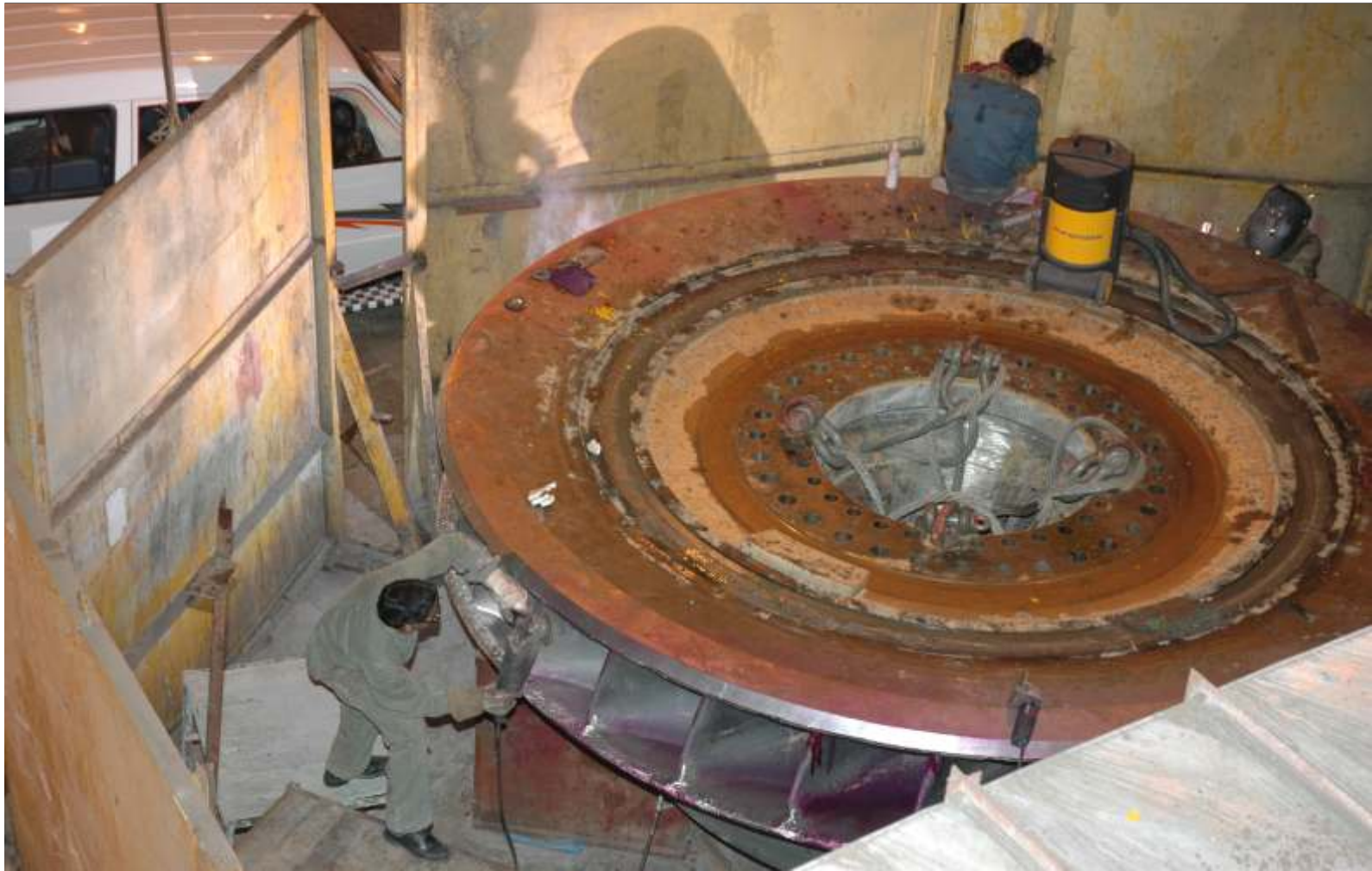
Runner Repair in progress (Unit No. 5)