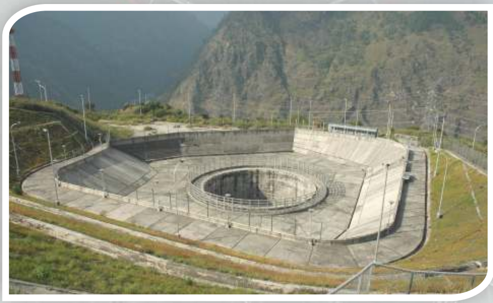
301 m. deep Surge Shaft of NJHPS