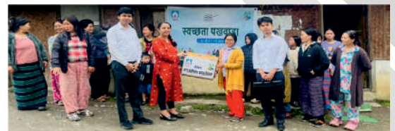
Attunli HEP, Arunachal Pradesh