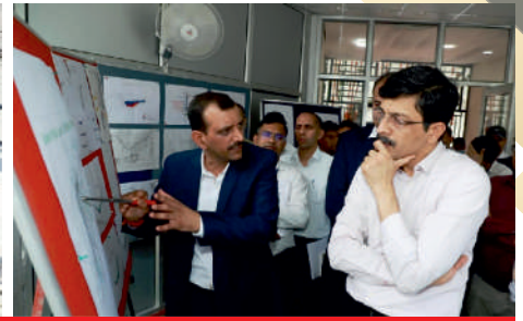
210 MW Luhri-1 Hydro Electric Project, HP