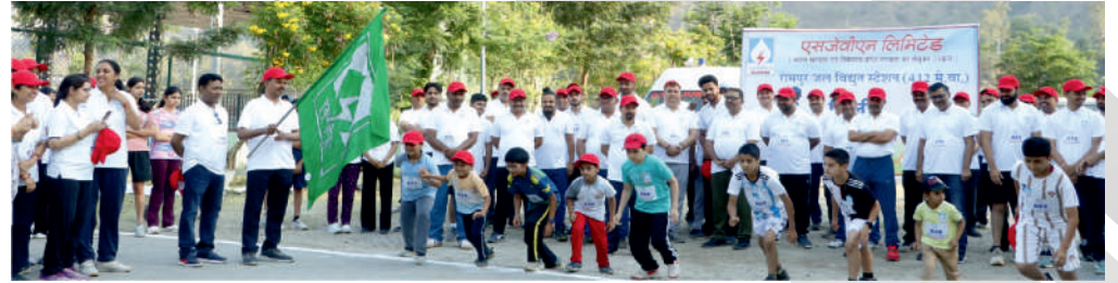
रामपुर हाइड्रो पावर स्टेशन में एसजेवीएन के 39वें स्थापना दिवस के उपलक्ष्य में 20 मई को मिनी मैराथन का आयोजन