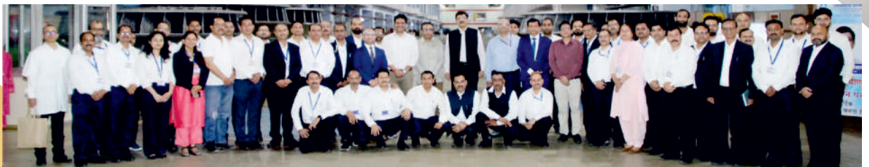
1500 MW Nathpa Jhakri Hydro Power Station, HP