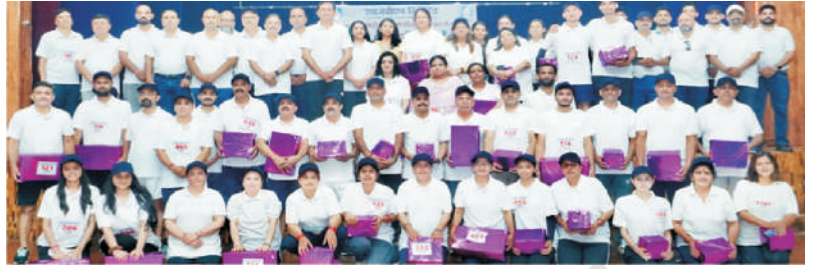
एनजेएचपीएस द्वारा स्थापना दिवस के अवसर पर मैराथन का आयोजन