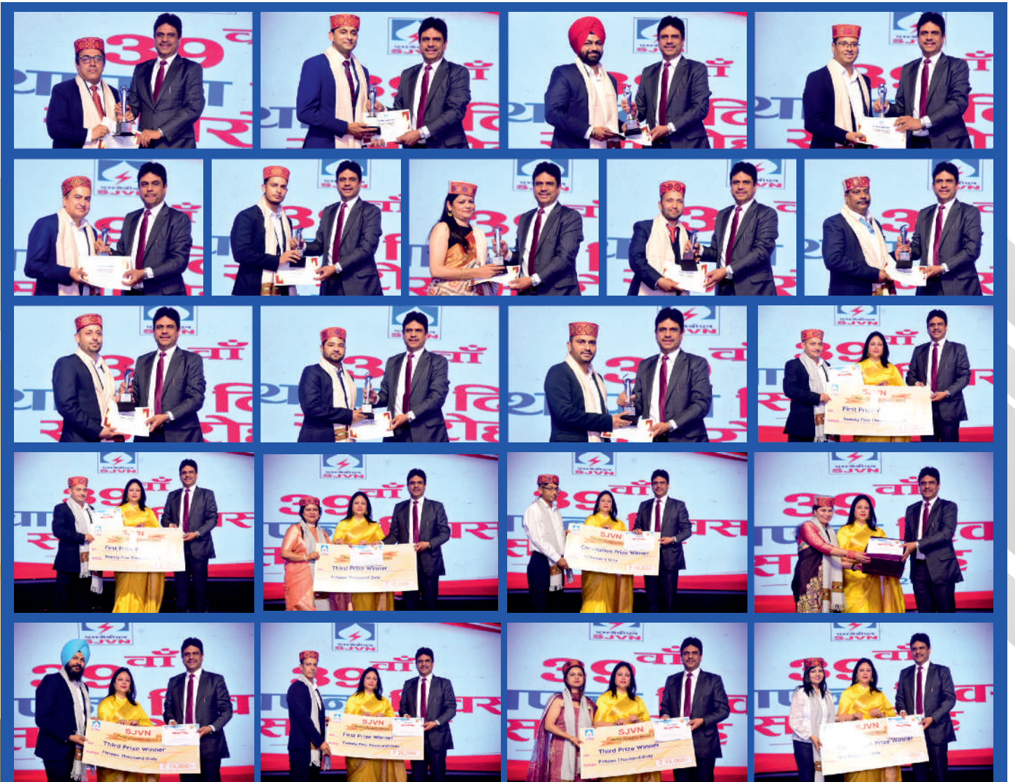
Felicitation of People Choice SJVN Star Awardees and Health Champions at CHQ, Shimla.